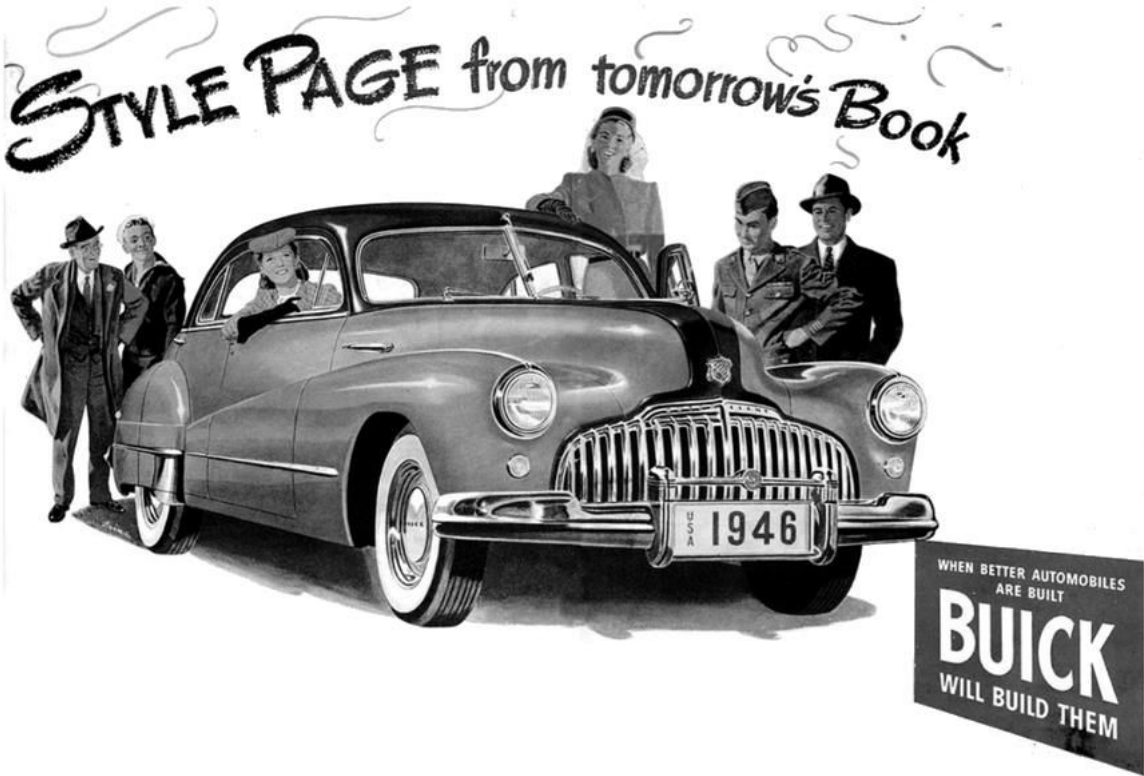
Buick vintage advertising, www.rarehistoricalphotos.com , 1946