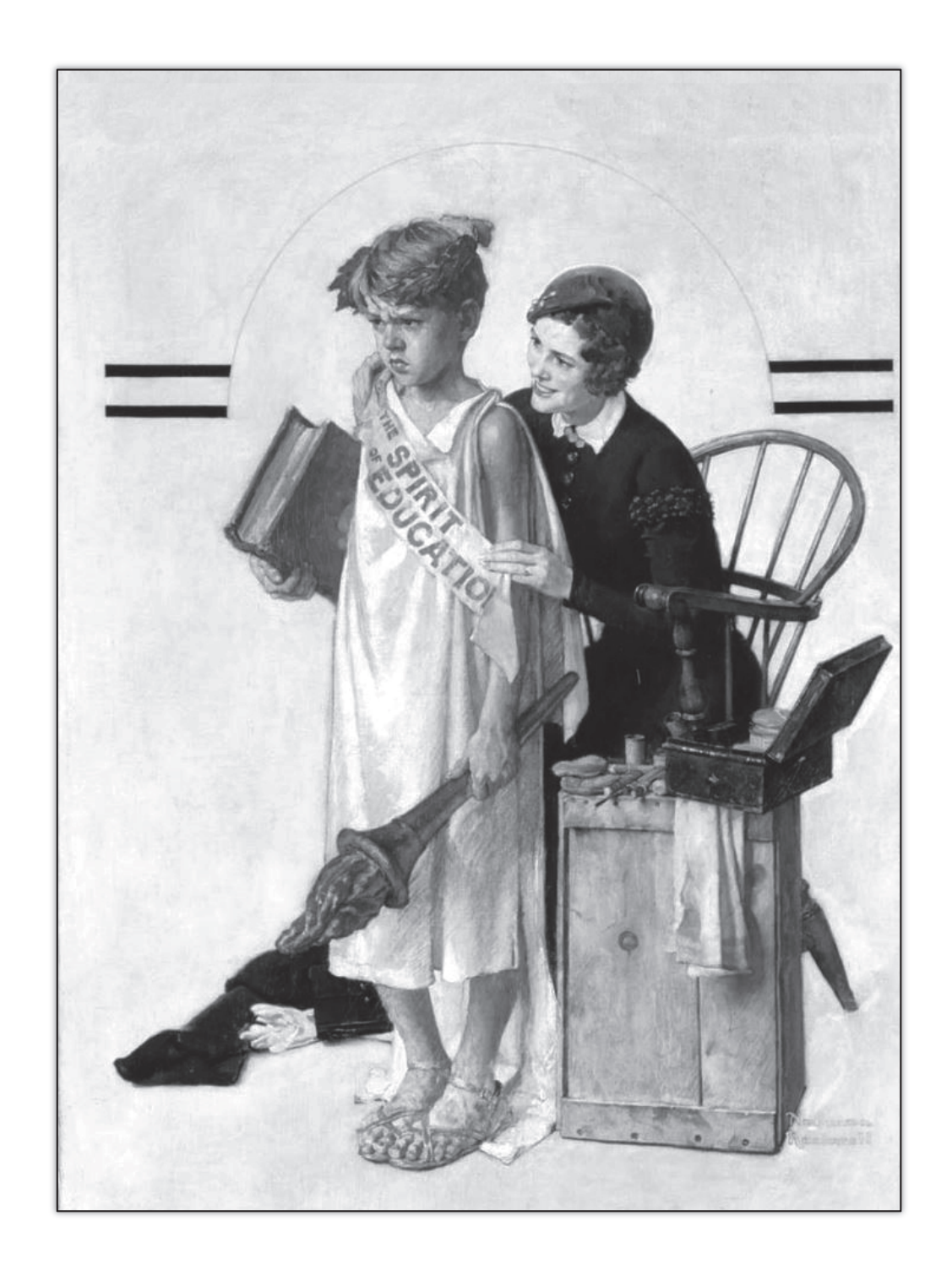
Norman ROCKWELL, The Spirit of Education, 1934.